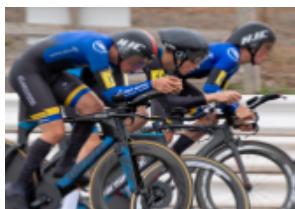
Team - Team Bottrill